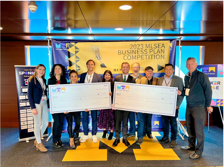
Figure 3 MiLSEA Business Plan Competition at the MI Tech Week